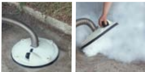
Drain Cup for forced emission.