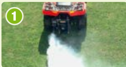
Back side outlet.