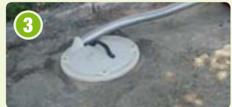
3 Fogging by Cup, for the forced injection into the drain covers (Sewers).