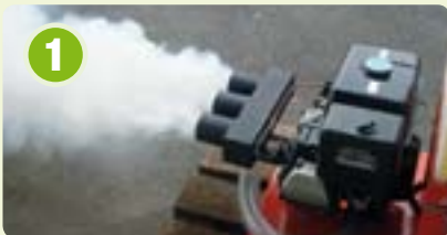
1 Fog by free Emission, in the Environment.