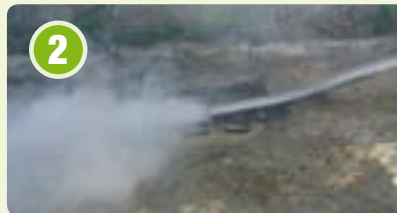
2 Fogging by Hand flexi-hose, for Warehouses, Greenhouses, Sewers, etc.